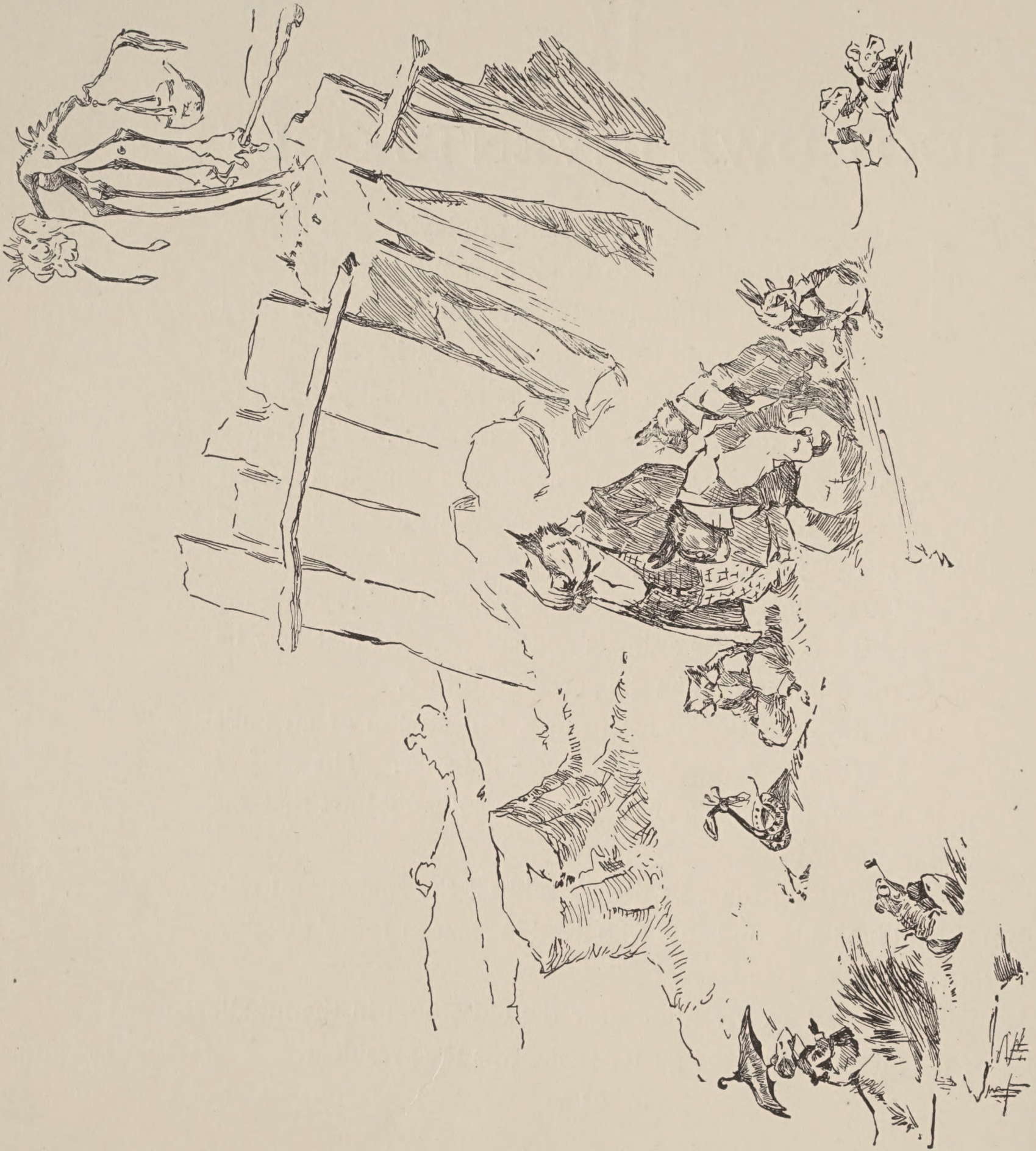
FIELD MOUSE ASKS IF THE BOGEY MAN SCARES THE CHILDREN.